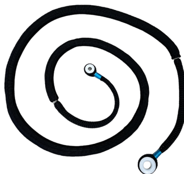
Temano® sandow polyester sleeve Ø18mm