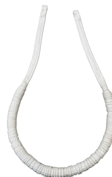
Temano® sandow Dyneema® sleeve Ø24mm