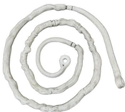
Temano® sandow polyester sleeve Ø34mm